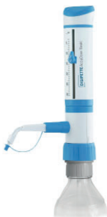
Digipette AccuDose Basic