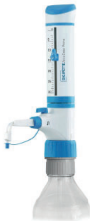
Digipette AccuDose Prime