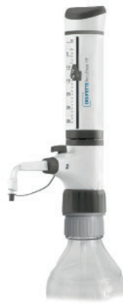
Digipette AccuDose HF

Este manual es parte inseparable del aparato por lo que debe estar disponible a todos los usuarios del equipo. Le recomendamos leer atentamente el presente manual y seguir rigurosamente los procedimientos de uso para obtener las máximas prestaciones y una mayor duración del mismo.