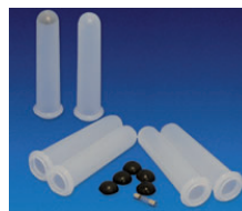
Accesory kit | GBK001 6 tub holders 6 bottom pads 1 fuse