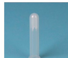
Adapter | GBK003 13x75 mm tubes