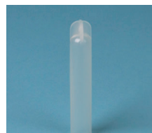
Adapter | GBK002 13x100 mm tubes