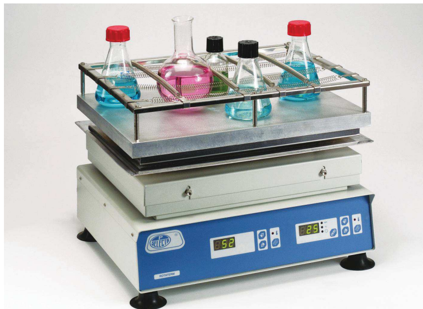
Part No 3000435 with platform and tensile spring clips.

Digital calibration temperature circuit.