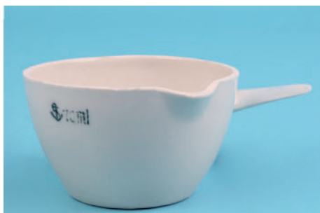
DIMENSIONS - Flat bottom