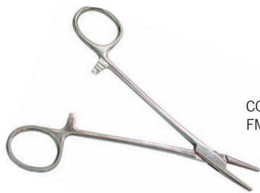
CODE: FML013, FML014 and FML019