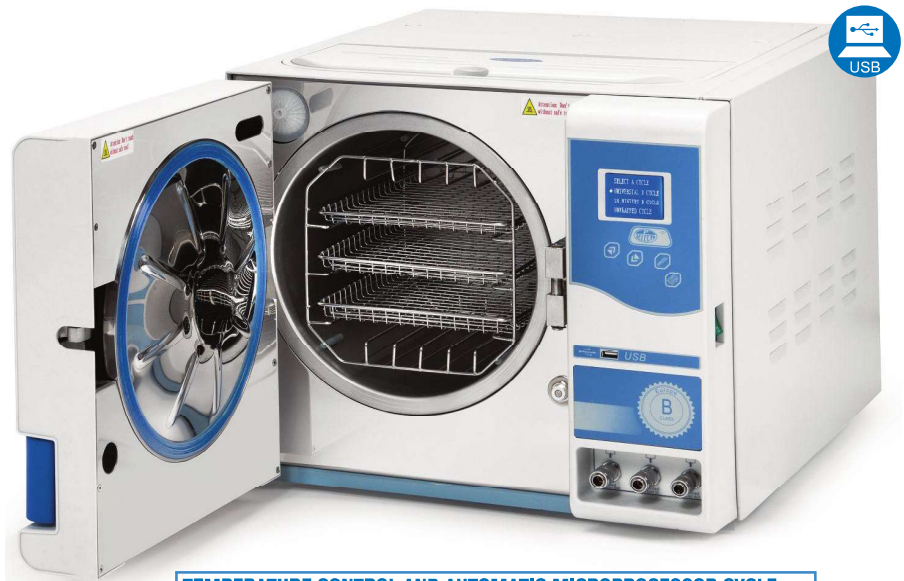
TEMPERATURE CONTROL AND AUTOMATIC MICROPROCESSOR CYCLE.