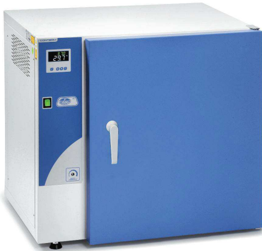
Models Conterm, Part No. 2000250, 2000251 and 2000253.

FEATURES, CONTROL PANEL, SAFETY, STANDARD AND ACCESSORIES (see pages 138 and 139).