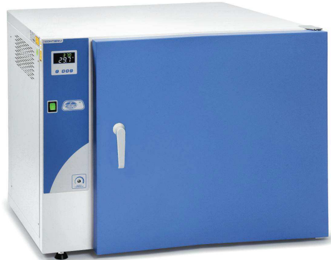
Model Conterm type Poupinel, Part No. 2000252 and 2000254.