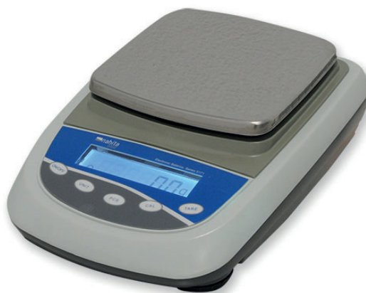
NOTE: Square pan size from 2000 g to 5000 g