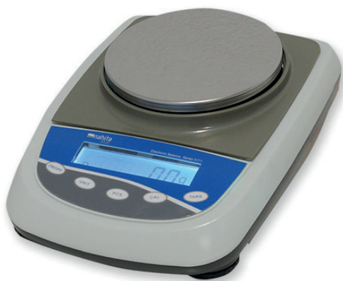
NOTE: Round pan size up to 2000 g