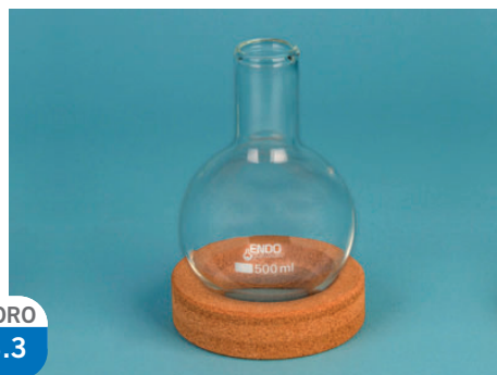
Round bottom FLASK, glass