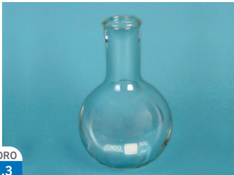
Flat bottom FLASK, glass