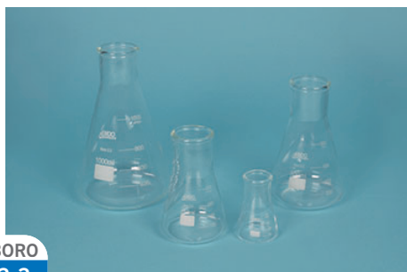
DIMENSIONS - Erlenmeyer