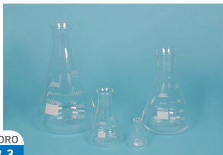
Erlenmeyer flasks, glass