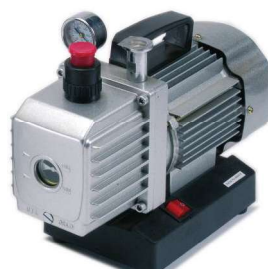
Part No. 5900621