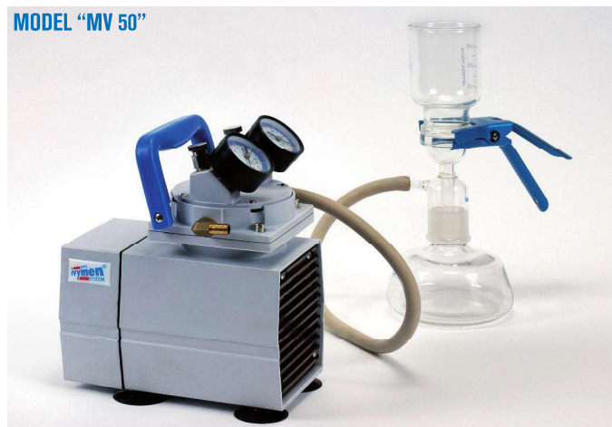
MODEL "MV 50"