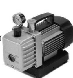
Part No. 5900620