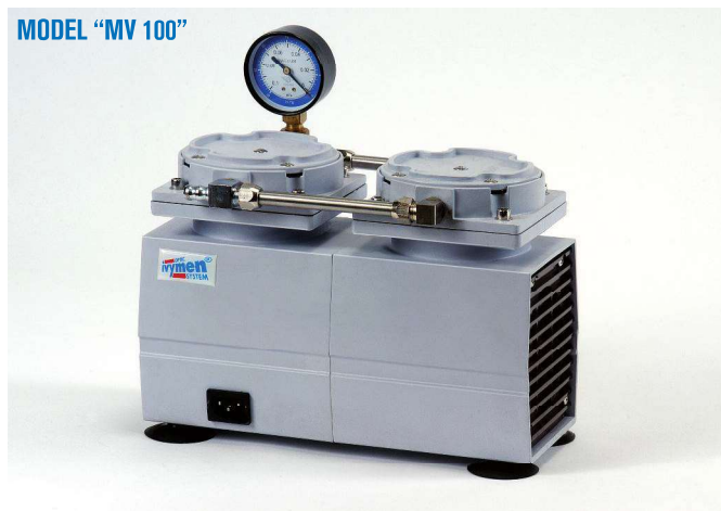
MODEL "MV 100"