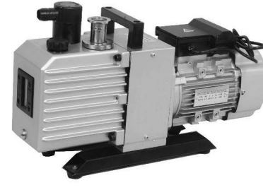
Part No. 5900622