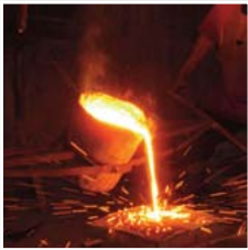
[06] Metallurgical industry