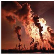
[07] Atmospheric pollution