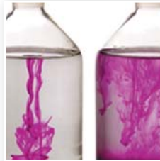
[08] Water and solvent